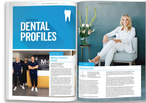
Spread, Full-page, or 1/2-page ad

tkiesenhofer@pdxmonthly.com (360) 947-9680