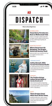
Native ad in Portland Monthly newsletter