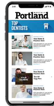
eBlasts to our subscribers and 50,000 targeted recipients