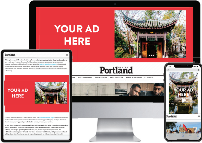
EXAMPLE SHOWN IS OUR HIGH IMPACT DISPLAY AD SET