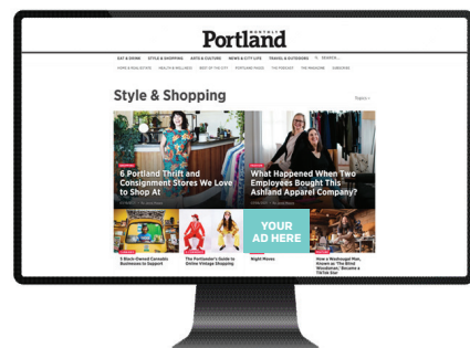
20k native impressions for your article on pdxmonthly.com